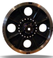
Falk Fan Spacer