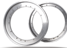
Falk Steel Clutch Drums