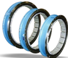
B7B Marine Air Clutch